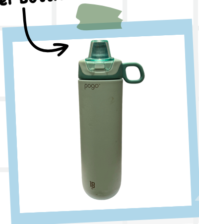
Light Green Pogo Water Bottle