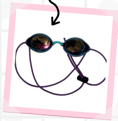
Blue & Purple Speedo Goggles