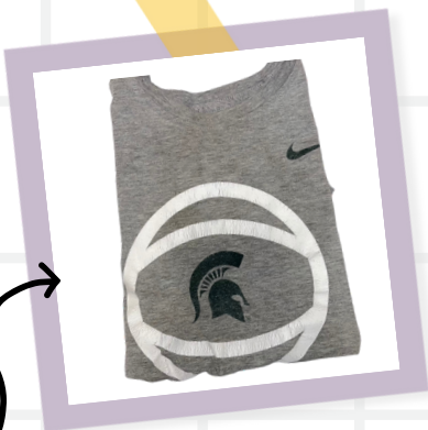
Grey Nike Spartans T-Shirt (Size 5)