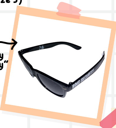
Bella Cuttery "Ring Security" Sunglasses