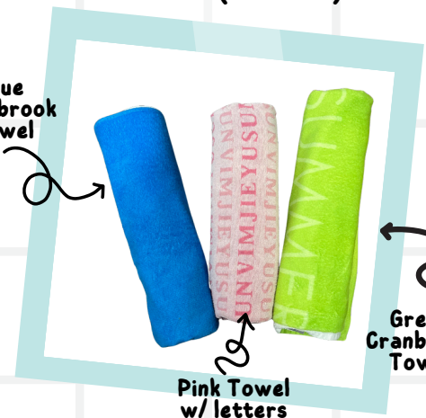
Blue Cranbrook Towel