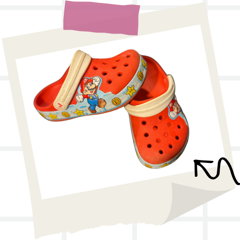
Mario Crocs (Size 8)