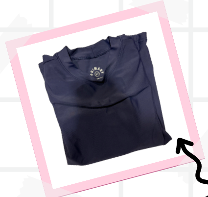
Navy Blue Primary Long-Sleeve Swim Shirt (Size 6-7)