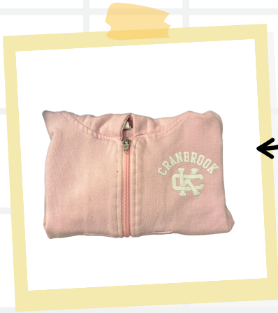
Pink Cranbrook Zip-Up Hoodie (Size 2)

**Please send us an email (BrooksideDayCamp@Cranbrook.edu) if you recognize any of these items!**