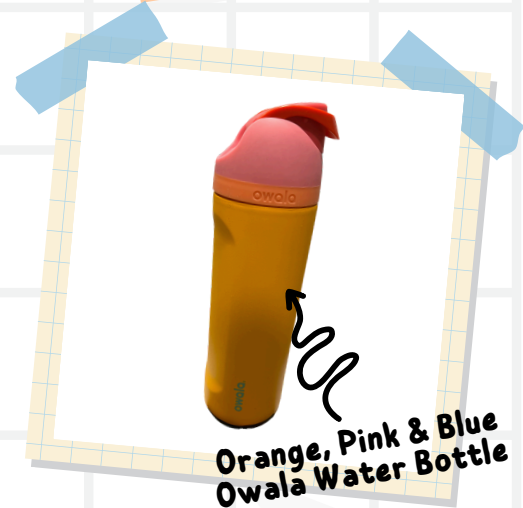
Orange, Pink & Blue Owala Water Bottle