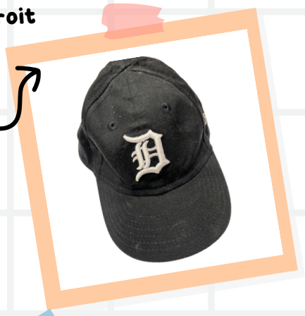
Navy Blue Detroit Tigers Hat